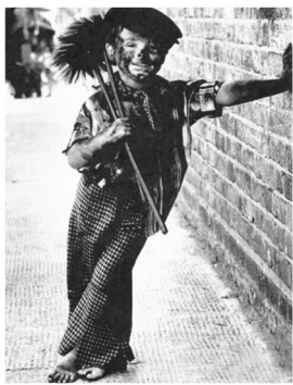
It is against company policy to employ small children

Fully insured for professional sweeping of solid fuel appliances and open fires. Certifate issued for insurance purposes. CCTV surveys if required.