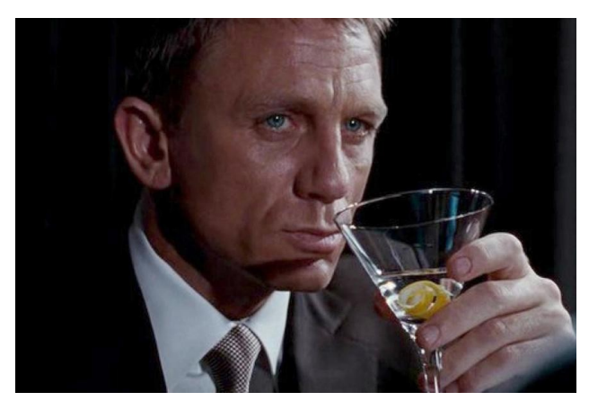
Good Evening, Mr Bond!

Here's a chance to blow away the January blues- we have booked a professional casino night organiser to organise a range of games- we will send out further details about allowable stakes etc. nearer the time.