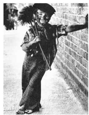
It is against company policy to employ small children

Fully insured for professional sweeping of solid fuel appliances and open fires. Certifate issued for insurance purposes. CCTV surveys if required.