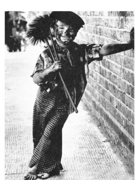
It is against company policy to employ small children

Fully insured for professional sweeping of solid fuel appliances and open fires. Certifate issued for insurance purposes. CCTV surveys if required.