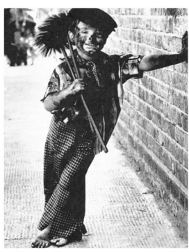
It is against company policy to employ small children

Fully insured for professional sweeping of solid fuel appliances and open fires. Certifate issued for insurance purposes. CCTV surveys if required.