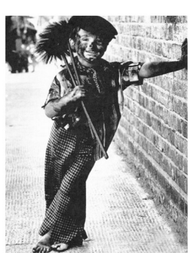
It is against company policy to employ small children

Fully insured for professional sweeping of solid fuel appliances and open fires. Certifate issued for insurance purposes. CCTV surveys if required.