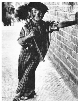
It is against company policy to employ small children

Fully insured for professional sweeping of solid fuel appliances and open fires. Certifate issued for insurance purposes. CCTV surveys if required.